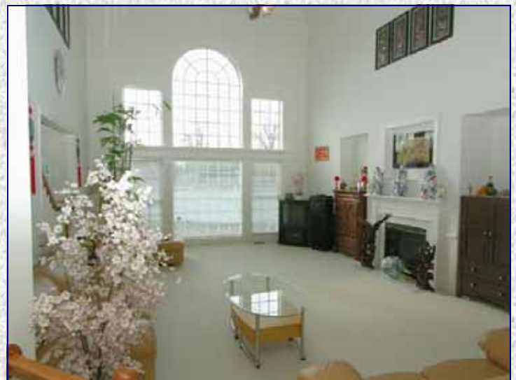
Family Room w/Coffered Ceiling