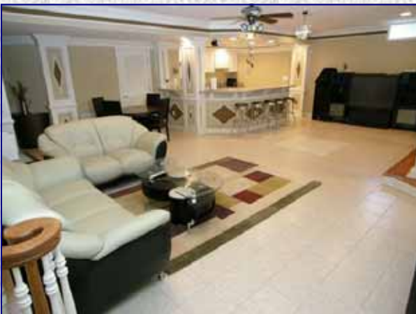
Fully Finished Rec Room w/2nd Kitchen