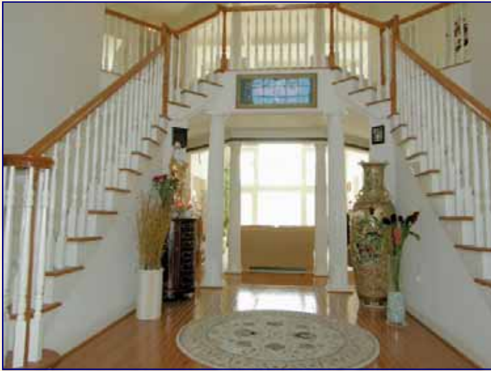
Grand Foyer—Dual Staircase