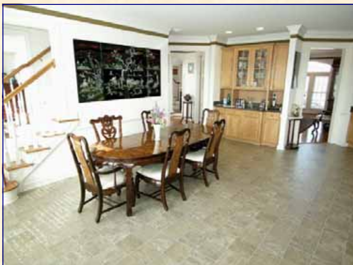
Dinette w/Resilient Flooring