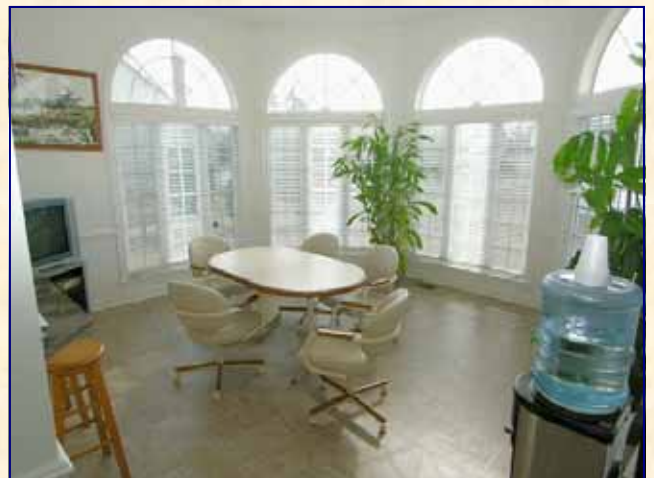
Morning Room Upgrade