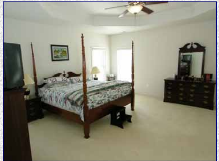
Master Suite w/Sitting Room