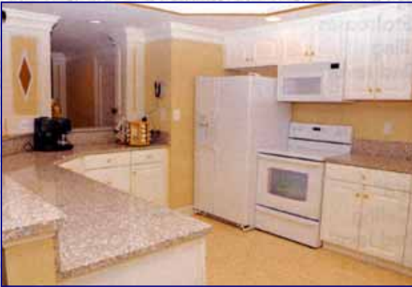
2nd Kitchen w/Bar